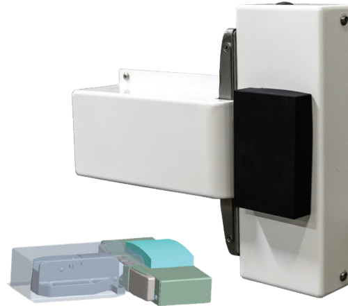
Fail Safe Operation

Warning: To ensure safe installation follow instructions enclosed within product shipping carton